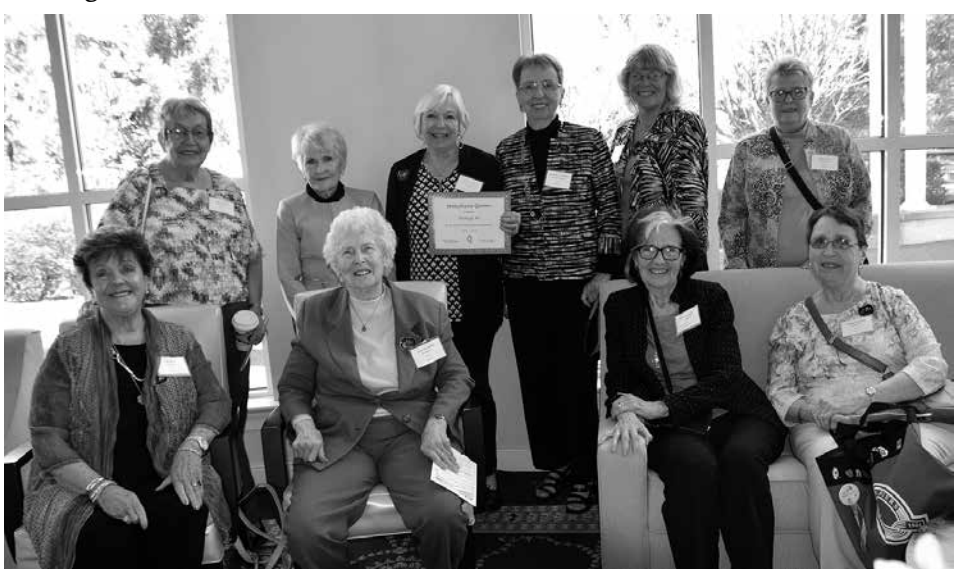
Heritage #1 celebrates 70th Anniversary