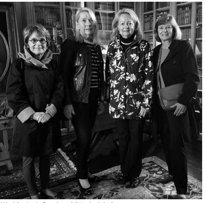
Washington's Crossing visit to Andalusia.