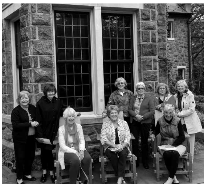
Freedom Valley visit to Stoneleigh.