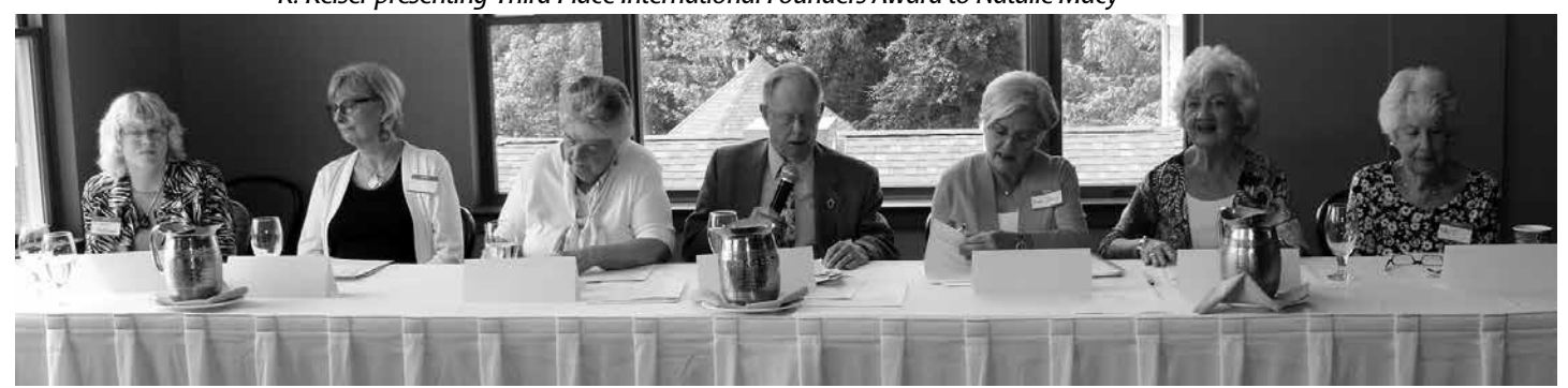
Current PA Quester Board