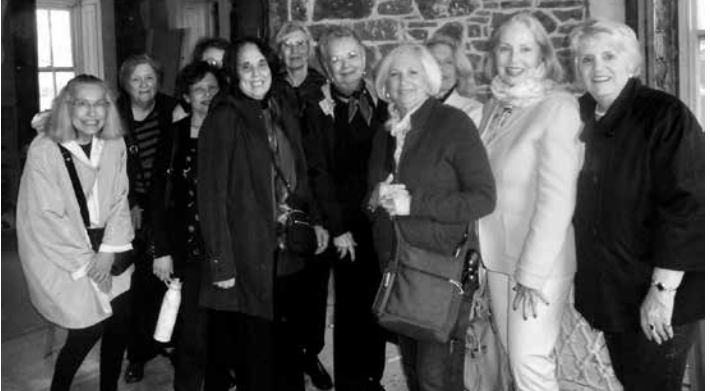
Conestoga at the Speaker's House.